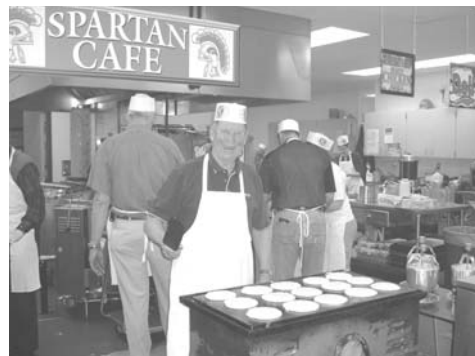
Marty Makes More Standard Fare