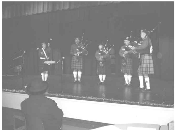
Even More Entertainment