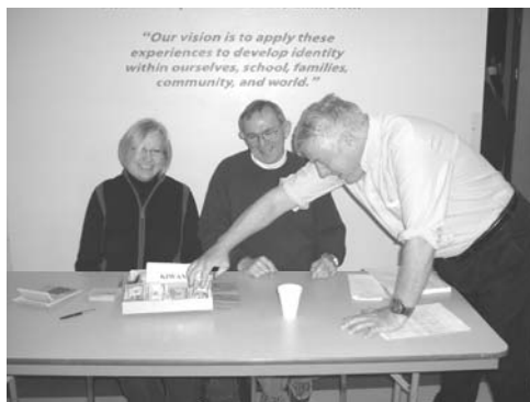
Dennis Tries to Take His Cut Early