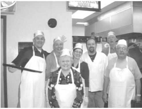
The Kitchen Staff